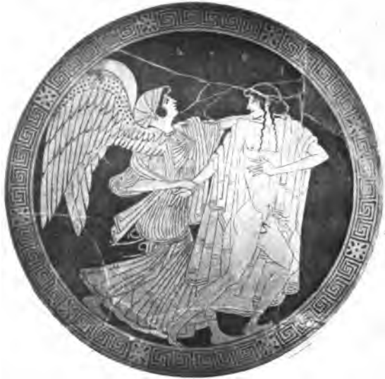
Fig. 78. Cephalus and the Dawn-Goddess.

husband of a love affair with Aura, the morning breeze, one day concealed herself in the bushes to spy on them. Cephalus, hearing a rustling in the underbrush, thought it some wild beast, hurled his unerring javelin, and killed his wife.